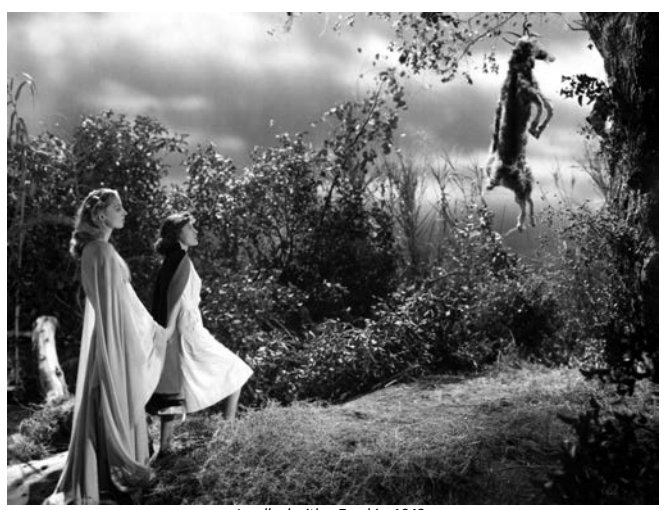
I walked with a Zombie, 1943